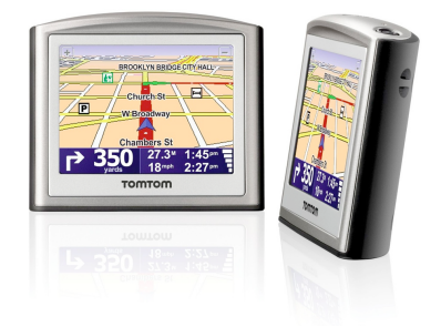
Portable navigation devices

In addition to significantly reducing fleet mileage, the entire service department will run more smoothly. You'll know exactly how every driver spends his time on the road, reduce payroll expenses and improve driver accountability. And internal operating procedures can be dramatically streamlined.