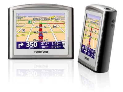
Portable navigation devices

In addition to significantly reducing fleet mileage, the entire service department will run more smoothly. You'll know exactly how every driver spends his time on the road, reduce payroll expenses and improve driver accountability. And internal operating procedures can be dramatically streamlined.